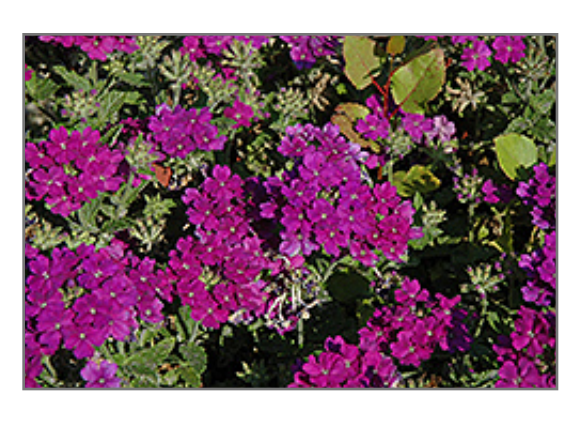
Lanai Blue Verbena flowers