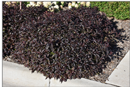
Spilled Wine Weigela