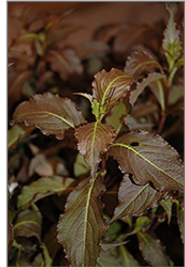
Spilled Wine Weigela foliage

Spilled Wine Weigela makes a fine choice for the outdoor landscape, but it is also well-suited for use in outdoor pots and containers. Because of its height, it is often used as a 'thriller' in the 'spiller-thriller-filler' container combination; plant it near the center of the pot, surrounded by smaller plants and those that spill over the edges. It is even sizeable enough that it can be grown alone in a suitable container. Note that when grown in a container, it may not perform exactly as indicated on the tag - this is to be expected. Also note that when growing plants in outdoor containers and baskets, they may require more frequent waterings than they would in the yard or garden. Be aware that in our climate, most plants cannot be expected to survive the winter if left in containers outdoors, and this plant is no exception. Contact our experts for more information on how to protect it over the winter months.