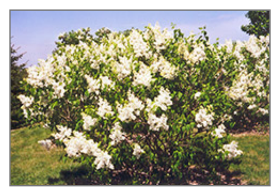
Mount Baker Lilac in bloom