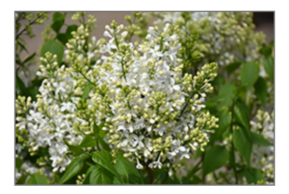
Mount Baker Lilac flowers

401 Torbay Road St. Johns, NL A1C 5C9 (709)726-1283 (877)726-1283