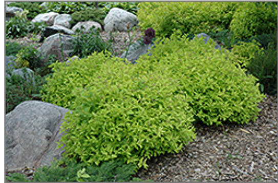
Goldmound Spirea