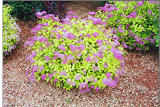
Goldmound Spirea in bloom

This shrub should only be grown in full sunlight. It prefers to grow in average to moist conditions, and shouldn't be allowed to dry out. It is not particular as to soil type or pH. It is highly tolerant of urban pollution and will even thrive in inner city environments. This is a selected variety of a species not originally from North America.