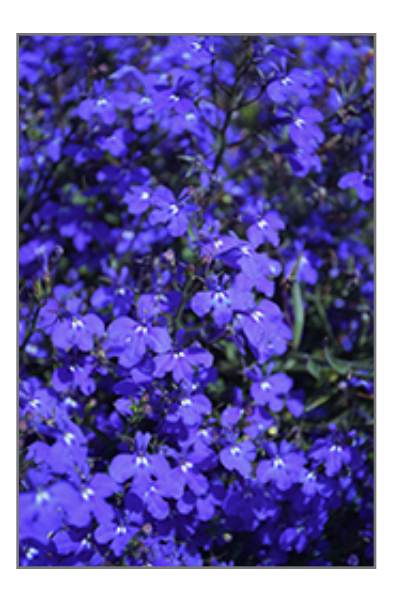
Techno Dark Blue Lobelia flowers

Techno Dark Blue Lobelia is recommended for the following landscape applications;