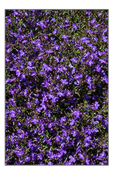
Techno Dark Blue Lobelia flowers