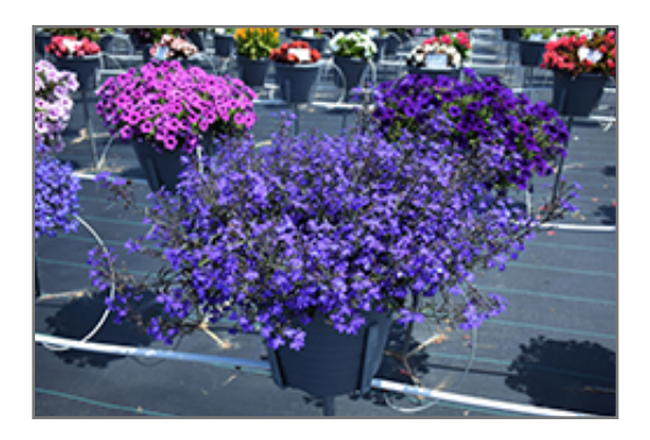
Techno Dark Blue Lobelia in bloom

Techno Dark Blue Lobelia will grow to be about 8 inches tall at maturity, with a spread of 12 inches. When grown in masses or used as a bedding plant, individual plants should be spaced approximately 10 inches apart. Its foliage tends to remain low and dense right to the ground. Although it's not a true annual, this fast-growing plant can be expected to behave as an annual in our climate if left outdoors over the winter, usually needing replacement the following year. As such, gardeners should take into consideration that it will perform differently than it would in its native habitat.