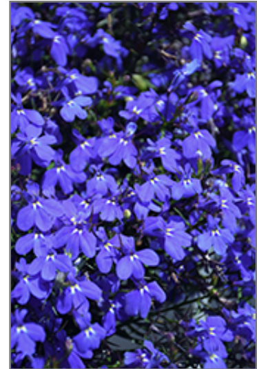
Techno Blue Lobelia flowers

Techno Blue Lobelia is recommended for the following landscape applications;