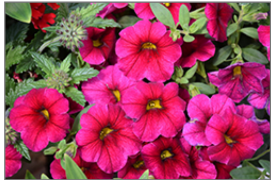
Superbells Cherry Red Calibrachoa flowers