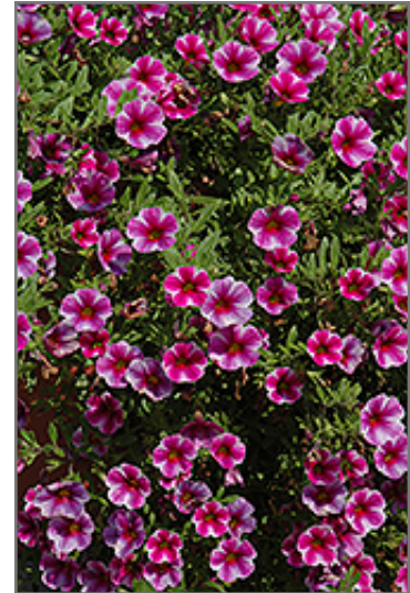
Can-Can Hot Pink Star Calibrachoa flowers

Can-Can Hot Pink Star Calibrachoa is recommended for the following landscape applications;