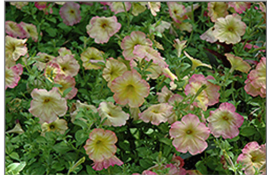
Debonair Dusty Rose Petunia flowers