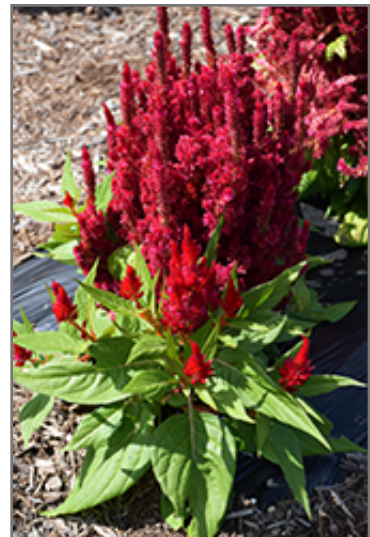
Fresh Look Red Celosia in bloom