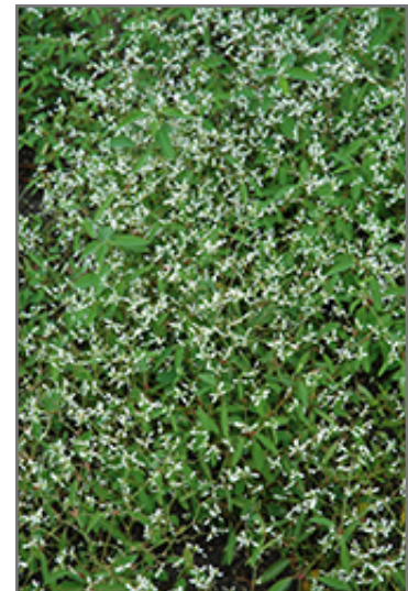
Breathless White Euphorbia flowers