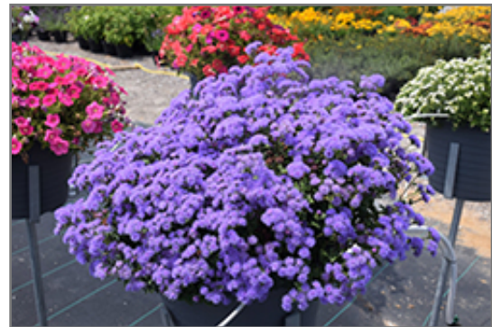
Artist Blue Flossflower in bloom