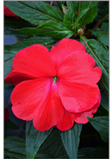
Sonic Red New Guinea Impatiens flowers

Sonic Red New Guinea Impatiens is recommended for the following landscape applications;