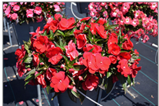
Sonic Red New Guinea Impatiens in bloom