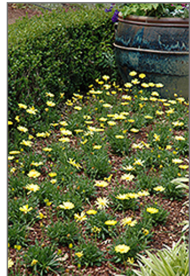
Voltage Yellow African Daisy flowers