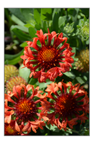
Fanfare Blaze Blanket Flower flowers

This stunning variety has stunning orange-red daisy-like flowers with recurved petals and darker red centers; prefers moist, rich sites but will adapt to dry sites; deadhead to promote re-blooming; good for naturalizing