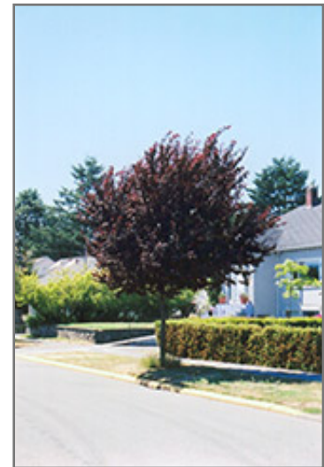
Newport Plum