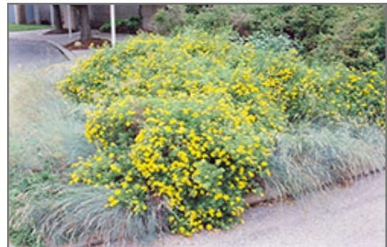
Goldfinger Potentilla in bloom