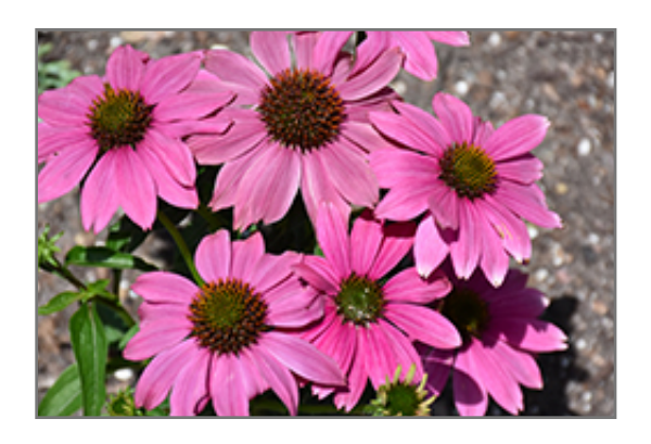
PowWow Wild Berry Coneflower flowers