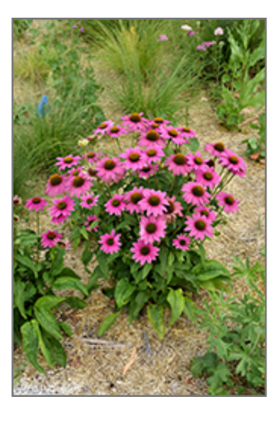
PowWow Wild Berry Coneflower in bloom

This is a relatively low maintenance plant, and is best cleaned up in early spring before it resumes active growth for the season. It is a good choice for attracting birds and butterflies to your yard, but is not particularly attractive to deer who tend to leave it alone in favor of tastier treats. It has no significant negative characteristics.