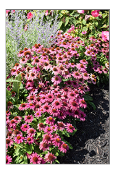
PowWow Wild Berry Coneflower in bloom

This plant should only be grown in full sunlight. It is very adaptable to both dry and moist locations, and should do just fine under typical garden conditions. It is considered to be drought-tolerant, and thus makes an ideal choice for a low-water garden or xeriscape application. It is not particular as to soil type or pH. It is highly tolerant of urban pollution and will even thrive in inner city environments. This is a selection of a native North American species. It can be propagated by division; however, as a cultivated variety, be aware that it may be subject to certain restrictions or prohibitions on propagation.