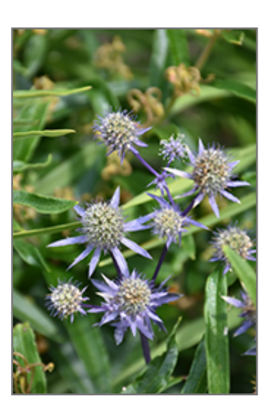
Blue Star Alpine Sea Holly flowers

Blue Star Alpine Sea Holly features bold steel blue ball-shaped flowers with silvery blue bracts at the ends of the stems from early to mid summer. The flowers are excellent for cutting. Its attractive spiny lobed leaves emerge steel blue in spring, turning silvery blue in colour throughout the season. The navy blue stems are very colorful and add to the overall interest of the plant.